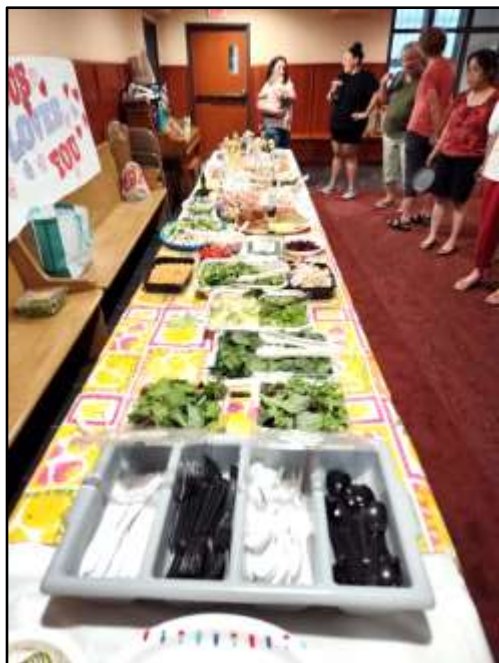
August Women's Dinner: Salad bar potluck!